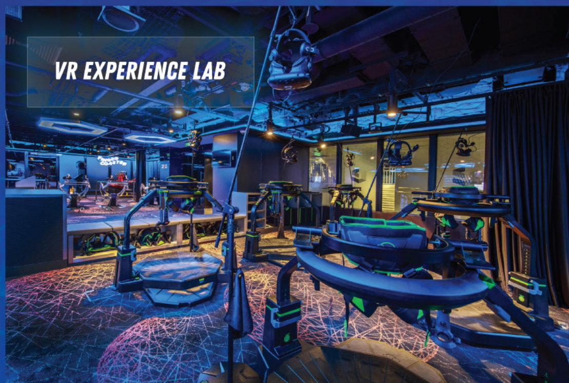
VR EXPERIENCE LAB